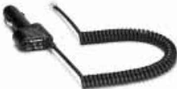
Coiled SmartPlug ▲ $29.95

The following accessories and replacement parts are available for BEL V955.