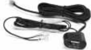
Direct-wire SmartPlug ▲ $29.95